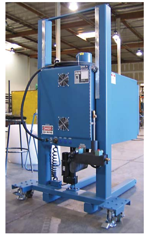
Bemco FTU3.2-73/316C with Electric Lift

Standard heating and cooling time on -73 to 316 C chambers from 23 C to -73 C and from 23 C to + 316 C (-100 to +600 F) is 30 minutes. Standard time for -184 to +638 C (-300 to +1000 F) chambers is 60 minutes.